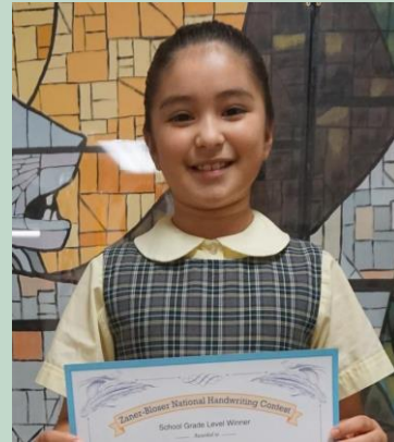
Basketball All Stars:

May 11: Metroplex Spirit Night (rescheduled)