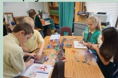
Precious Kindergarten Writing: