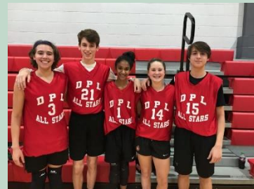
8th Grade Basketball Rose Ceremonies: