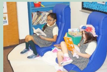
PK3 Calming the Sea: